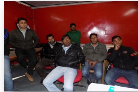
First Aid Training