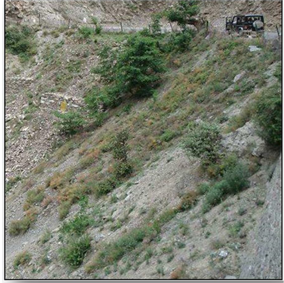
Plantation by Forest Department against Forest Protection