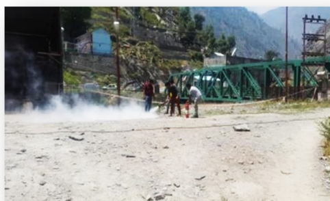
Conducting Mock drill at Regular Interval