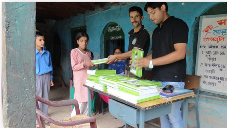
Distribution of free note books to the students in school