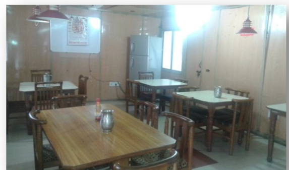
Community Kitchen for Staff