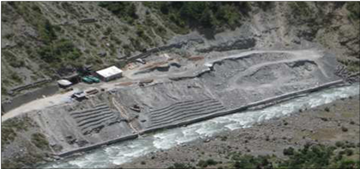
River Protection Work