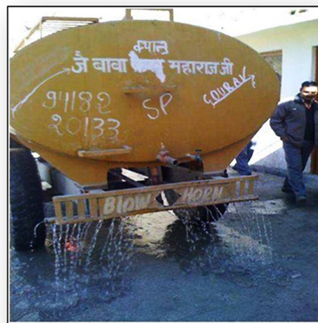
Air Pollution Control Measures at Site