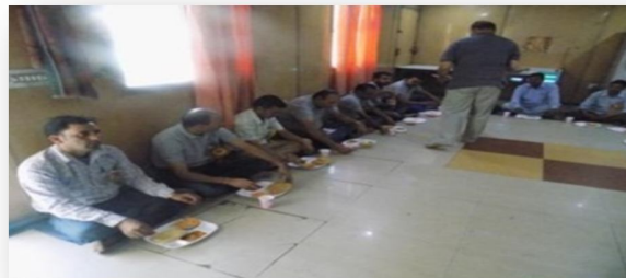
Environmental day celebrations at site