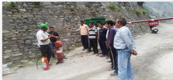
Firefighting Training for workers and Security Personnel