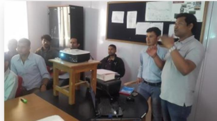
TNI Training for staffs and Workers