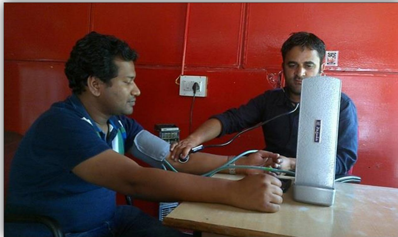
Routine Medical Checkup by Project Health Service Team