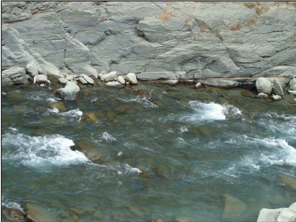
Water Quality of River Budhil

Water sampling locations have been identified in project area to monitor the Water quality of Budhil River. The main parameters being analyzed are PH, TSS, TDS, TS etc by Himachal Pradesh Pollution Control Board, Chamba.