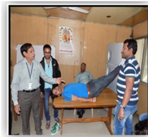
Safety Instructions at Site – OCP Training